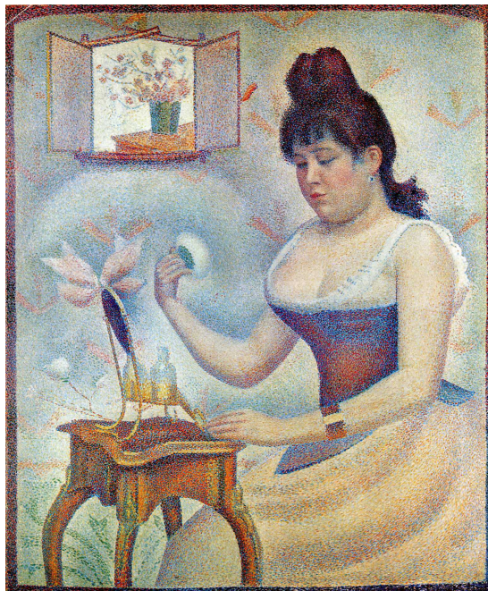
12. WOMAN POWDERING HERSELF. Probably 1889-1890. London, Courtauld Institute Galleries (Home House Trustee)